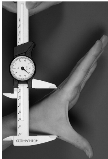
FIGURE 2: Active IMD measurement performed using a caliper.

thumb was read from the nail marking position above the protractor.